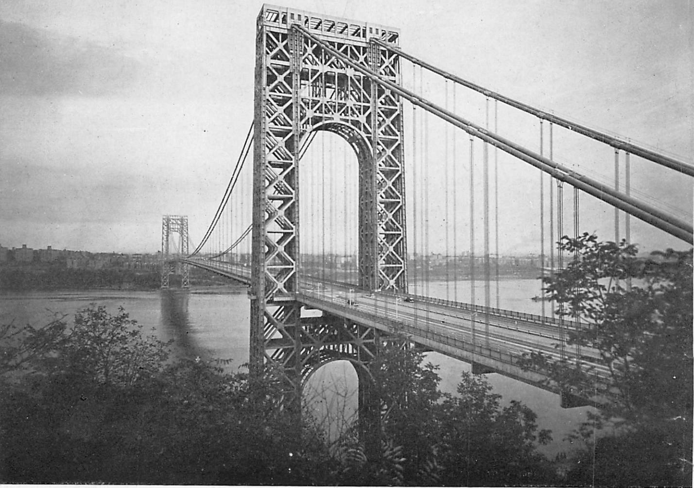
THE GEORGE WASHINGTON BRIDGE—NEW YORK CITY