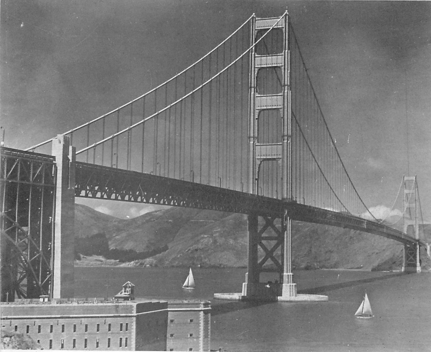
THE GOLDEN GATE BRIDGE — SAN FRANCISCO