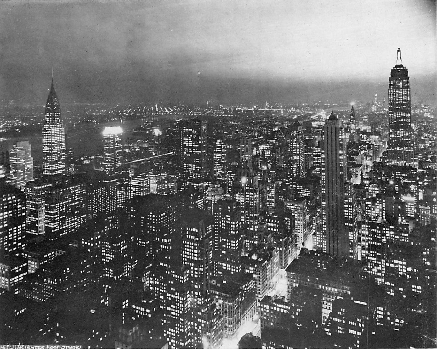
NIGHT SCENE OF MIDTOWN MANHATTAN